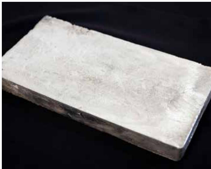
Silver bar - Vertical casted