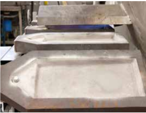
Molds for anodes casting