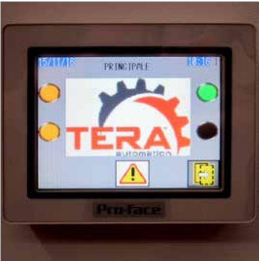
PLC + HMI touch screen