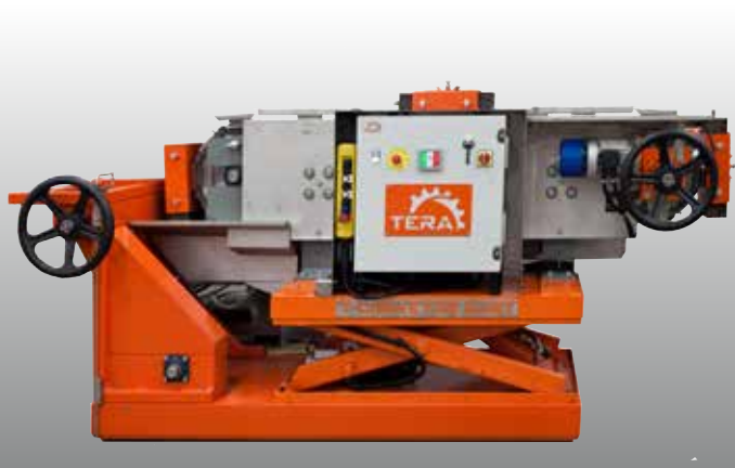
T-Conveyor Cast for vertical casting - Custom designed upon request