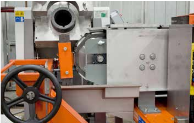
Tilting furnace + Mold ready for vertical casting