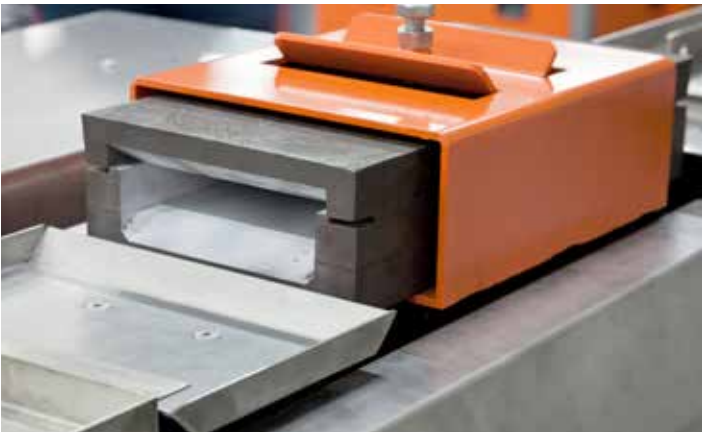
Mold for vertical casting